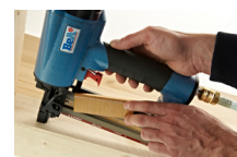
Fast easy loading system